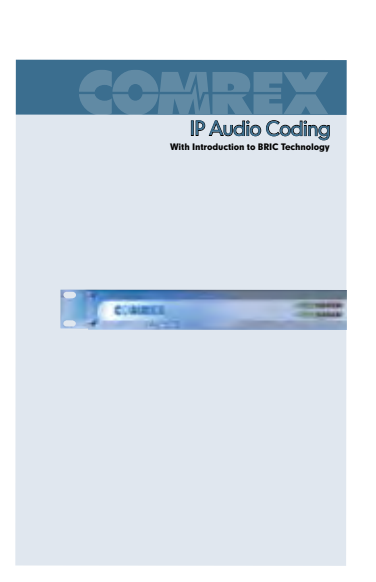
To learn more about BRIC Technology, contact Comrex for a free booklet — "IP Audio Coding with Introduction to BRIC Technology."