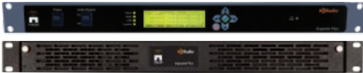
Exporter Plus (top) and Importer Plus (bottom)

Additional digital channels can be added by deploying an optional Nautel Importer Plus and appropriate iBiquity Corporation licenses. The Nautel Importer Plus codes the secondary program and data services of an IBOC transmission including digital channels two to four and passes its output to an Exporter. A convenient user interface permits the selection of IBOC service modes and partitioning of IBOC signal bandwidth for a variety of audio multicasting. Both the Importer Plus and Exporter Plus are 1U rack mount 100% solid state devices that provide outstanding reliability.