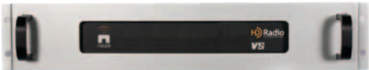
VS HD Digital Upgrade