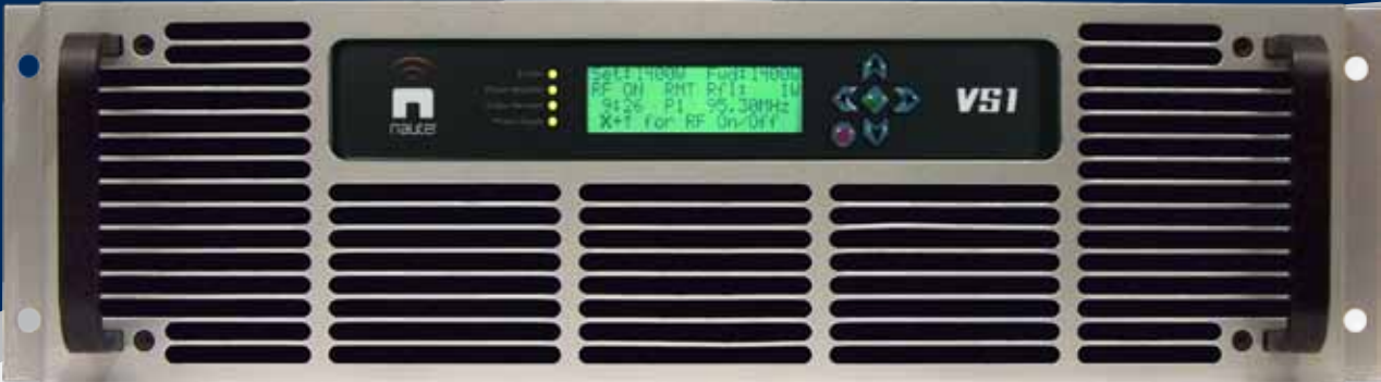
VS1 1kW Analog